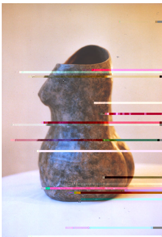
Unquq Warmi: Pregnant (also Fed up or Fat) Woman (2004) Figs. 5,6