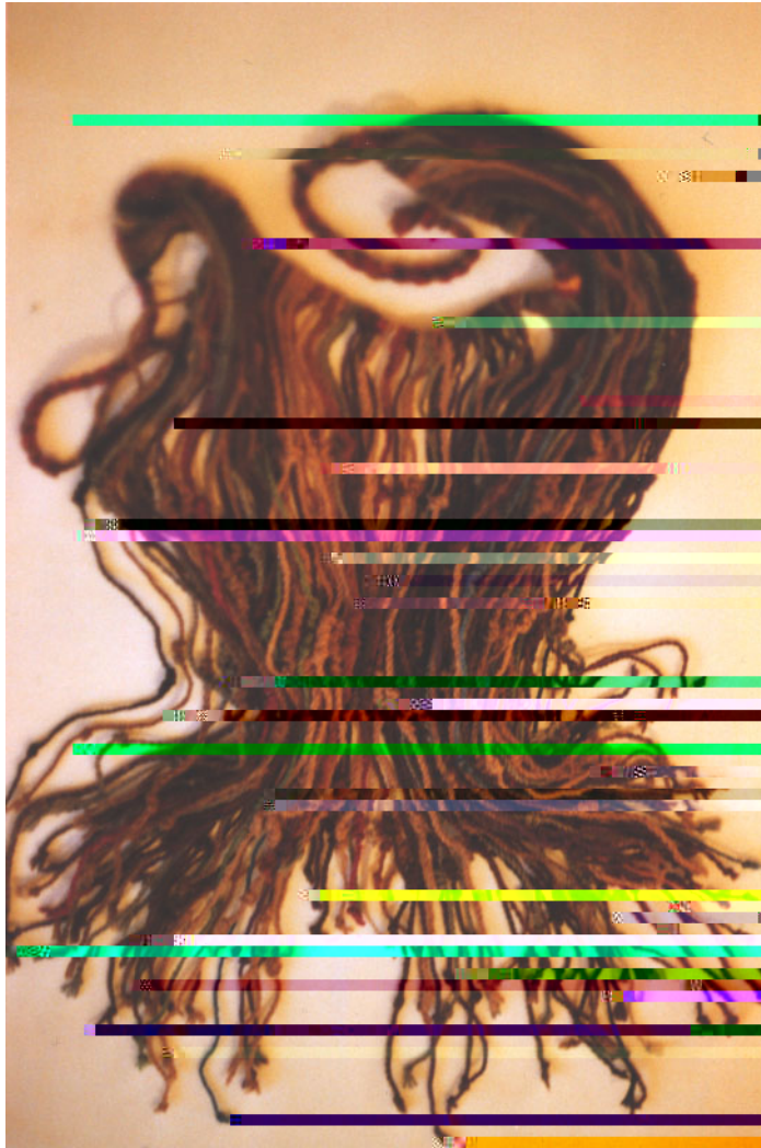
Quipu: Quipu (2005) Fig. 11